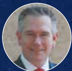
Ross Fox Archdiocese of Canberra and Goulburn