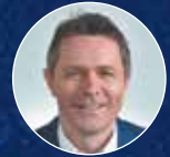
The Hon Jason Clare MP Minister for Education