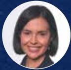
The Hon Prue Car MP Deputy Premier and Minister for Education NSW